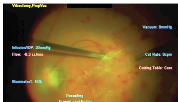
Fig. 1. Proportion reflux hydrodissection in complex combined rhegmatogenous and tractional retinal detachments using the 25+ gauge vitrectomy system.