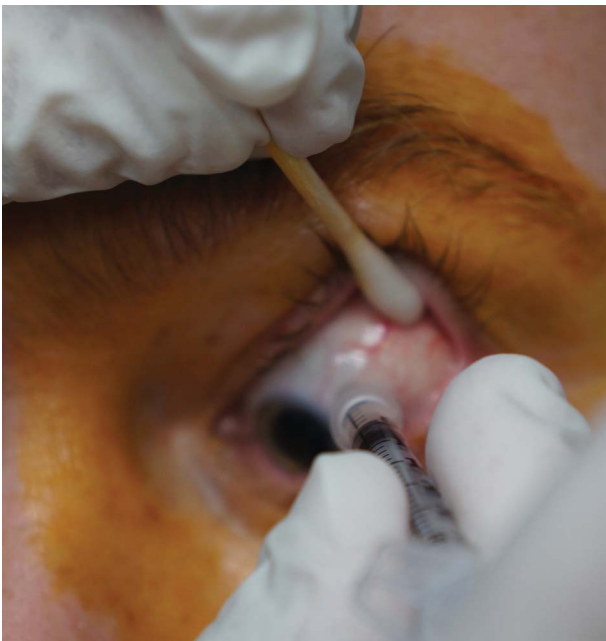
Fig. 3. An injection is administered and needle withdrawn.

developed an inferior retinal detachment several weeks after a repeated injection of Avastin for choroidal neovascularization.