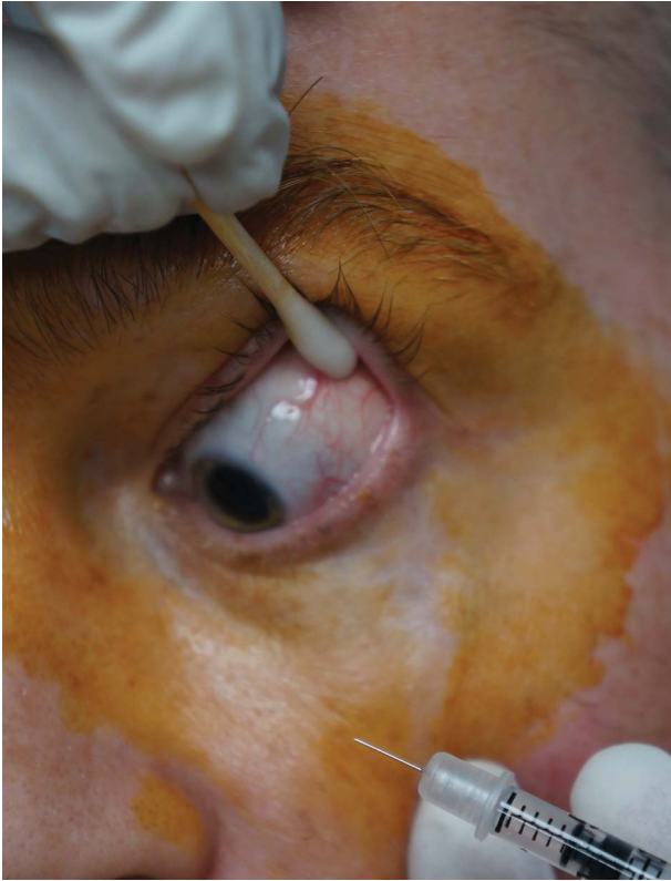
Fig. 2. The cotton-tip applicator is used to maintain the upper eyelid in the open position because the patient looks down in adduction. The cotton-tip portion of the applicator can be used to apply pressure to the globe to maintain infra-adduction.

developed an inferior retinal detachment several weeks after a repeated injection of Avastin for choroidal neovascularization.