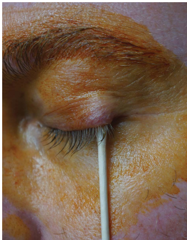
Fig. 1. The cotton-tip applicator is applied under the outer third of the eyelid.

The author has safely performed ~2,000 consecutive intravitreal injections with this technique. Five patients have required the use of a sterile lid speculum upon repeated injection due to excessive squeezing. Most of the injections (>90%) were with bevacizumab (Avastin). There has been only one noted corneal abrasion and no incidence of lens damage, retinal breaks, or endophthalmitis. 5 One very elderly aphakic patient