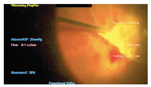
Fig. 2. Proportion reflux hydrodissection in complex combined rhematogenous and tractional retinal detachments using the 25+ gauge vitrectomy system.

tissue (Figures 1–3). The author has used this technique in more than 100 patients with a complicated traction retinal detachment. This technique offers numerous advantages. First, in complex cases with a combined traction rhegmatogenous retinal detachment, it allows for simultaneous separation of the fibrovascular tissue while allowing for normal retinal tissue to be pushed away from the port of the cutter. Second, no additional instrumentation or equipment is required. Third, this is an efficient surgical technique only requiring a click of the foot pedal without removing the vitreous cutter from the eye.